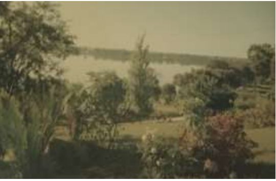
Ballenger residence The Esplanade, Mount Pleasant; view to the Canning River (Sue Callum). Jack was building a residence at 191 The Esplanade, Mount Pleasant of his own

design. Family also recall that he was involved with design work for the ABC